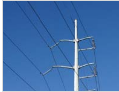
Maine Public Utilities Commission Approves Transmission Rein ...