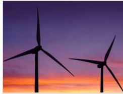
Saddleback Wind Project Approved: New Blades Will Reduce Sou ...