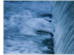
Energy News Roundup: August 20- August 26 ...